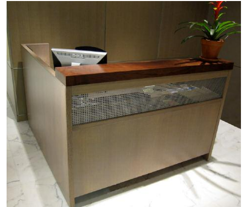
A simple and elegant combination of rift oak structure, aluminum mesh grill and a 3" thick walnut transaction counter. Client: Braver Stern