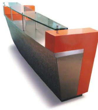
Curved stainless steel, lacquered wood and glass transaction counter convey the leading edge design attitude of this international publisher. Client: Conde Nast

We'll work with you, with no obligation, to create a design that meets your specific requirements. Let us know the technology that needs to be accommodated, approximate dimensions or available space, suggested materials and general budget objectives. We'll respond with a detailed perspective drawing for review and comment. Or, we can modify one of our existing designs to meet your functional and aesthetic objectives.