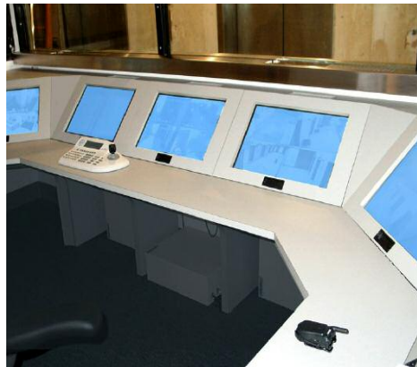
Reception and Security desk supports a CCTV screen array on hinged, lift-up frames for access to cable management chase. Client: Rolex