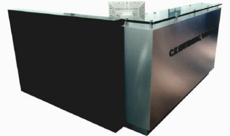
Ebonized oak veneer contrasts with brushed aluminum and a glass transaction counter in this rectilinear desk design. Client: Unterberg Tobin