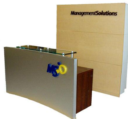
The subtle curve of this cost-effective reception desk sets off a Spanish management consultant firm's colorful logotype. Client: Mostrador